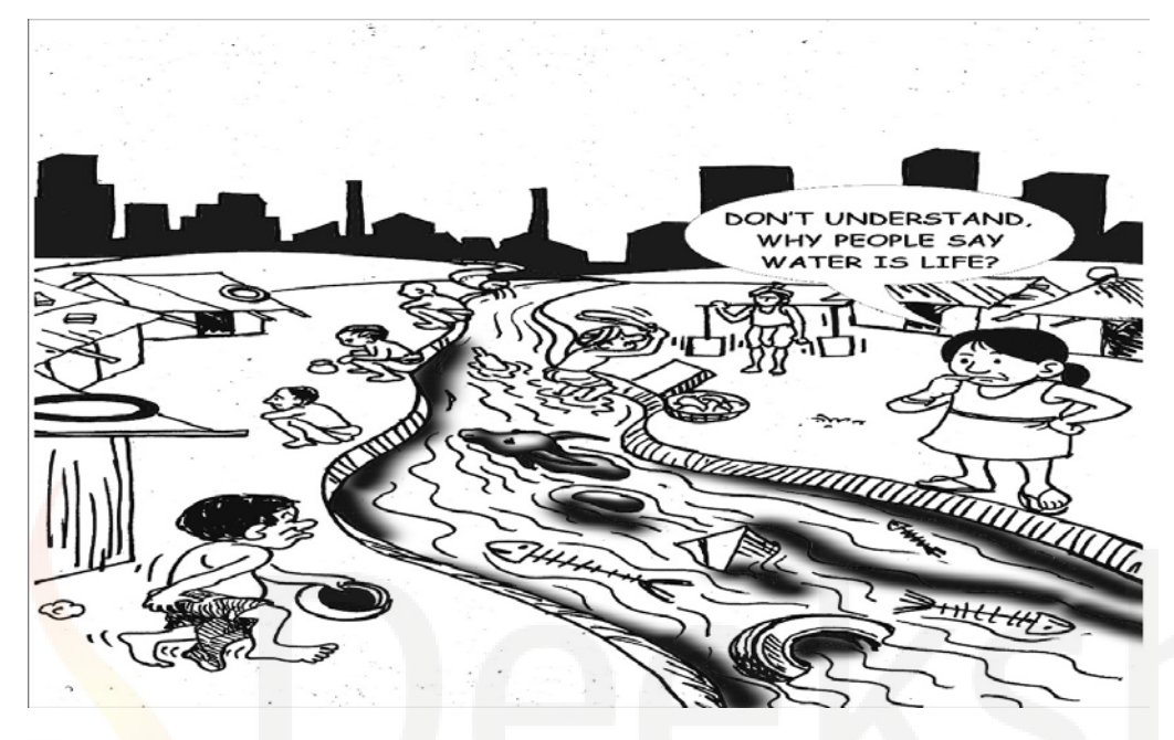
Q4. Develop a short story with the help of the given visual / starting line .Give a suitable title to your story . (150-200 words) 10 marks

India is a highly populated country . People lack in maintaining proper sanitation and hygiene as a result they suffer from various diseases . India has a serious sanitation challenge; around 60 per cent of the world's open defecation takes place in India. Poor sanitation causes health hazards including diarrheoa, particularly in children under 5 years of age, malnutrition and deficiencies in physical development and cognitive ability. You are Nitish /Nikita, head boy/girl of Anand Public School, Jaipur. Write a letter to the editor of a national daily, highlighting the problem and suggesting practical ways to ensure public sanitation and the right to dignity and privacy . (100-120 words, 8 marks )